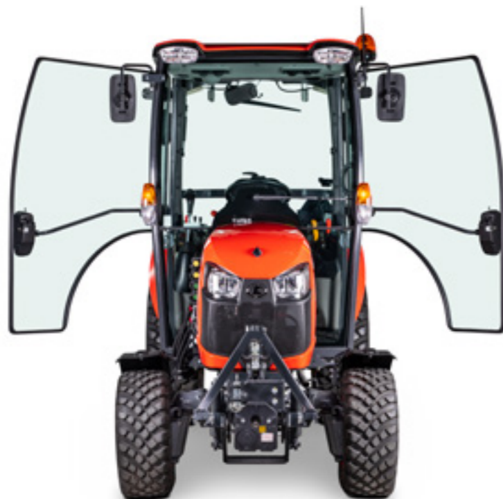
Front-linkage not available in the UK

High daily productivity requires a high level of driving comfort. The comfortable cab of the B2 is designed to enable you to work with concentration over the course of a long working day. This allows you to fully exploit the high performance potential of these machines at all times.