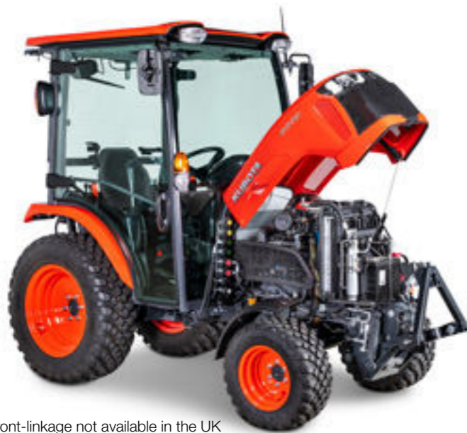
Front-linkage not available in the UK

Kubota's high-torque 3-cylinder diesel engines deliver the necessary power for demanding applications and provide plenty of traction for transport work. Their efficiency and agreeably quieter operation are further persuasive plus points.