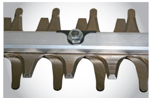
Integrated blunt – blunts are part of the blade

The HCA-265ES-LW has a 25.4cc engine and Easy Start for fast, almost effortless starting. Its double-edged blades are nickel-plated so stay sharper for longer.