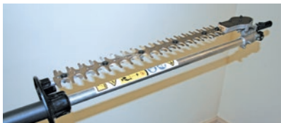
180° rotation into storage position