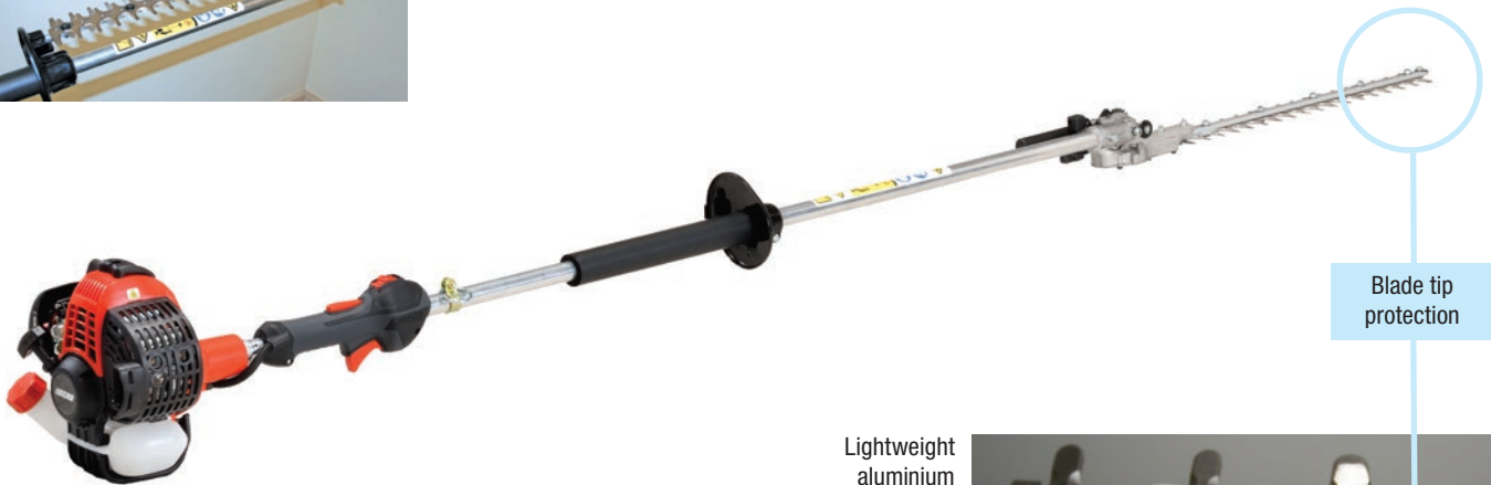
Blade tip protection