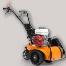
EDGE STYLER PRO