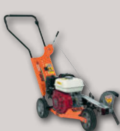
KS 300 PRO

Visit www.elieta.eu and find out how ELIET can help you maintain a perfect lawn.