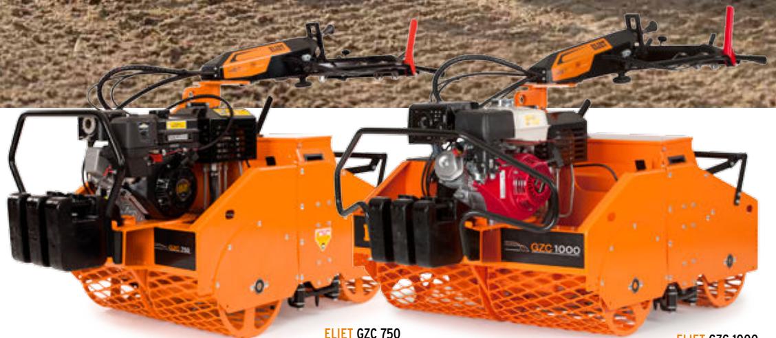
ELIET GZC 750